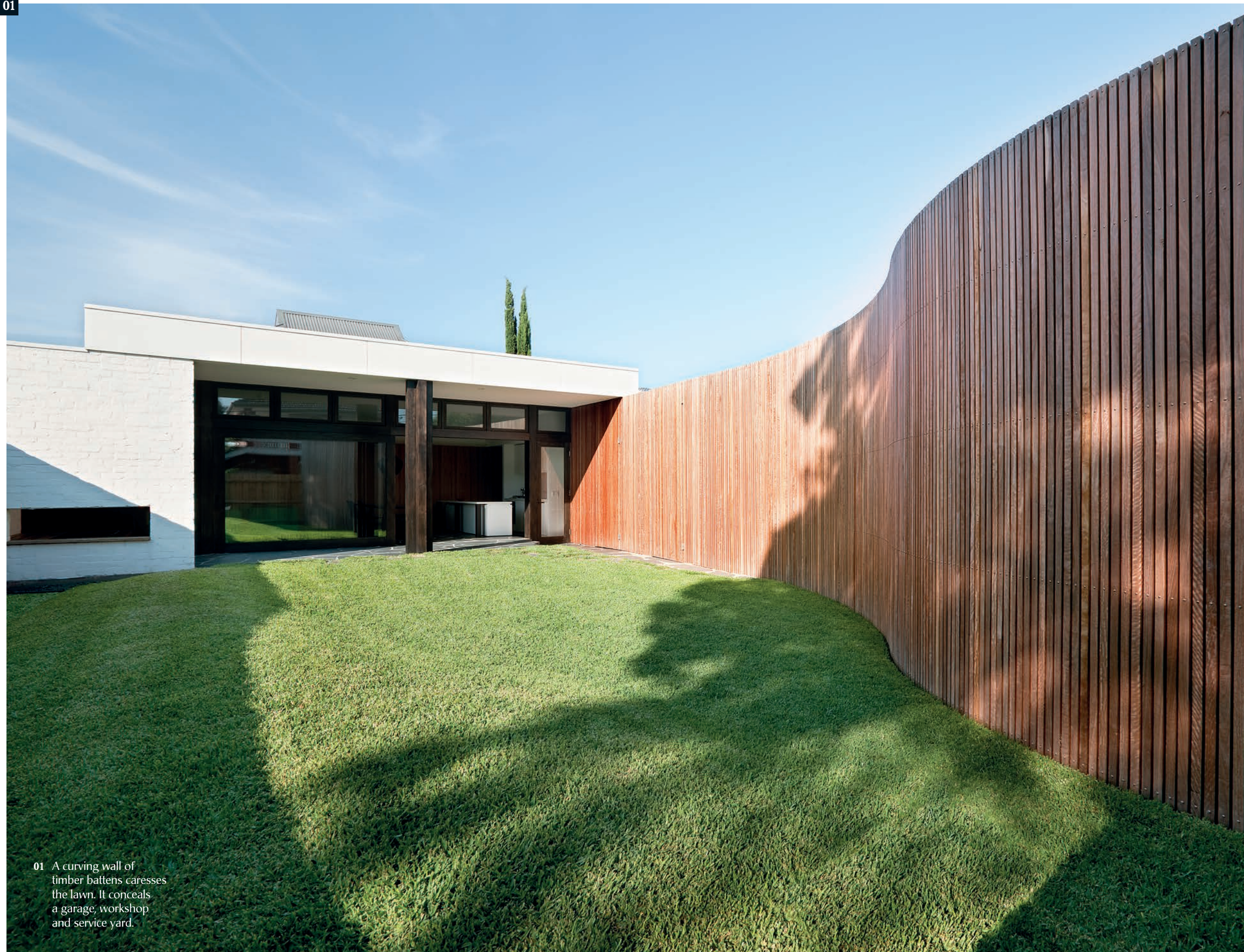
01 A curving wall of timber battens caresses the lawn. It conceals a garage, workshop and service yard.