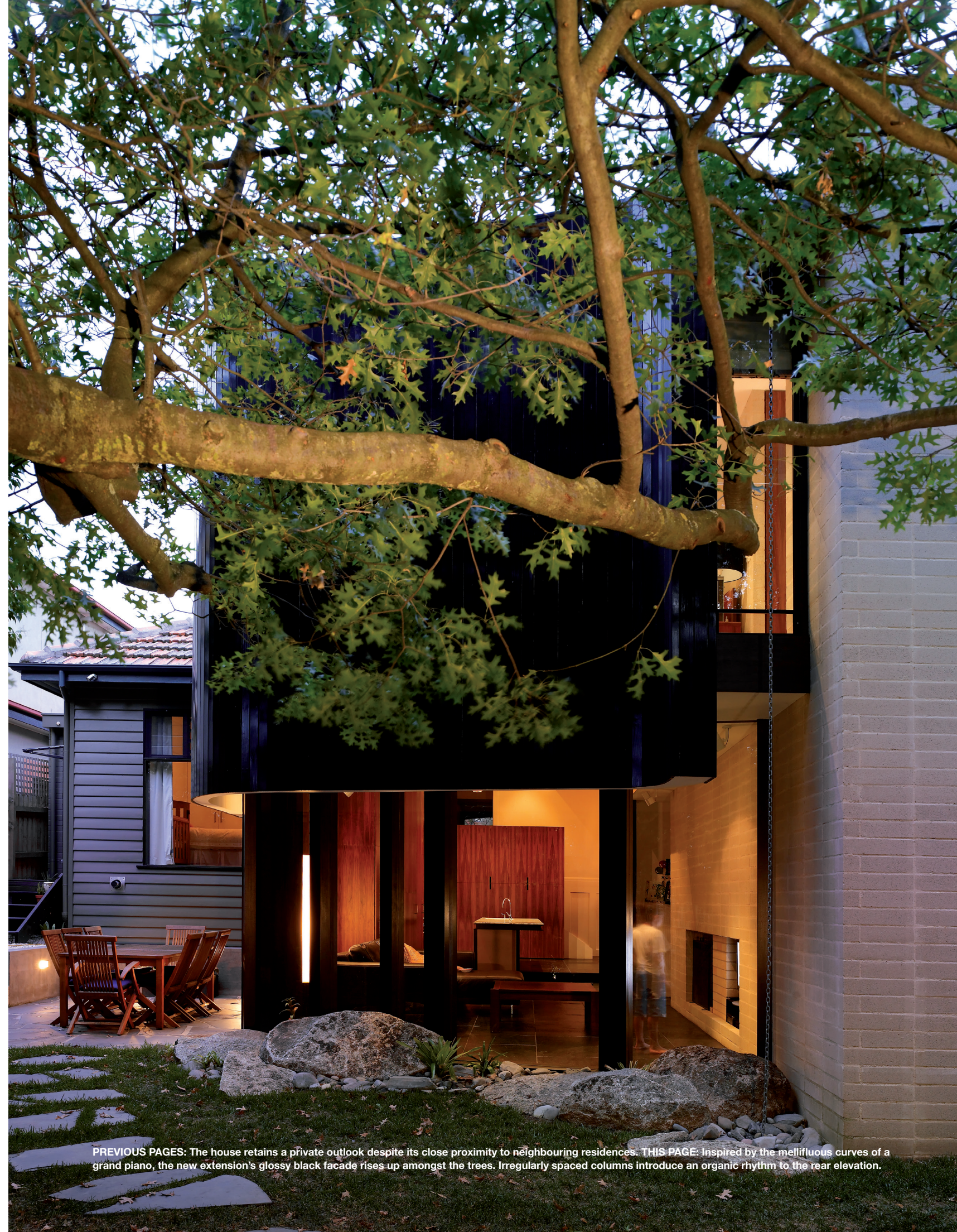
PREVIOUS PAGES: The house retains a private outlook despite its close proximity to neighbouring residences. THIS PAGE: Inspired by the mellifluous curves of a grand piano, the new extension's glossy black facade rises up amongst the trees. Irregularly spaced columns introduce an organic rhythm to the rear elevation.