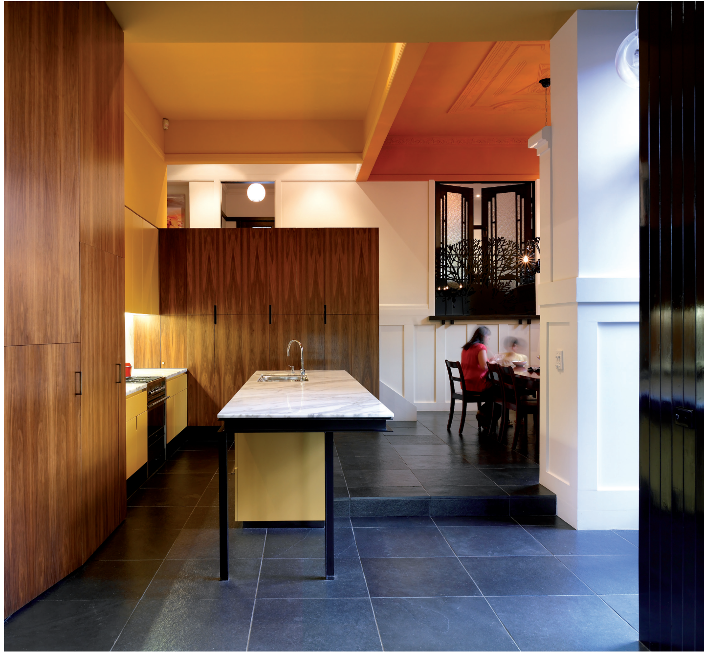
ABOVE: Features from the original house that have been retained, such as the ceiling detail above the dining table, provide a link to the history of the building. OPPOSITE: Upstairs, the curving wall of the master bedroom helps create a sense of private retreat. FOLLOWING PAGE: Glazed double doors, now protected by a delicately detailed balustrade, indicate the original floor height of the old house. The dining room lamp now hangs where it might have almost touched the floor.