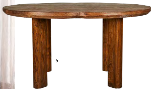
1 'Altura' floor lamp, $3790, from Fanuli. 2 'Ajmer' wool rug in Denim, $1450, from Hali. 3 Stoff Nagel candlestick in Brass, $308, from RoyalDesign.com. 4 'Peplum' vase in speckled white, $375, from Eun Ceramics. 5 'Ode' dining table, $3190, from Clo Studios.