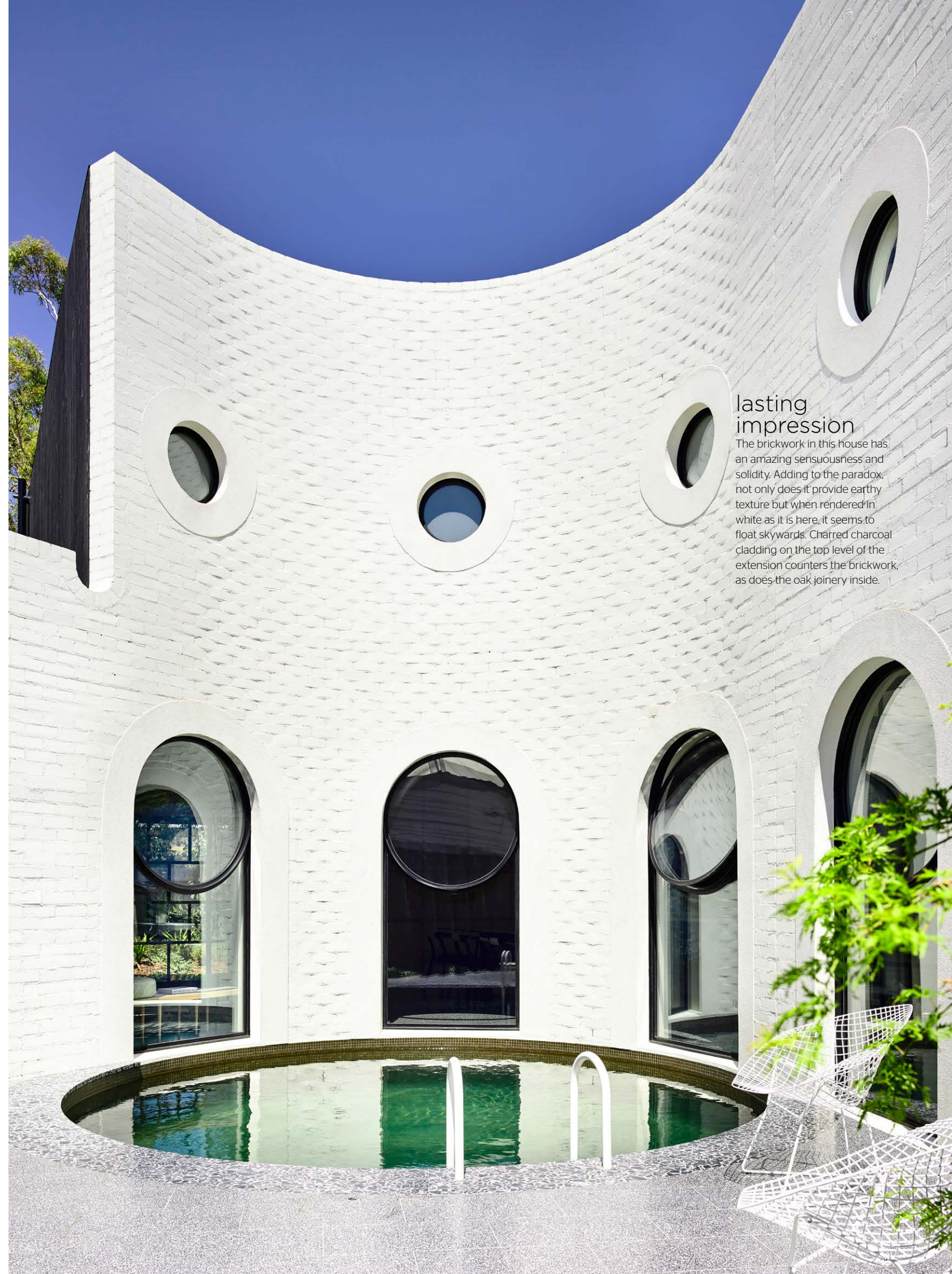
EXTERIOR (opposite) That striking façade never fails to intrigue, made of 'Nubrik' bricks from Austral Bricks painted in Dulux Grand Piano Half.