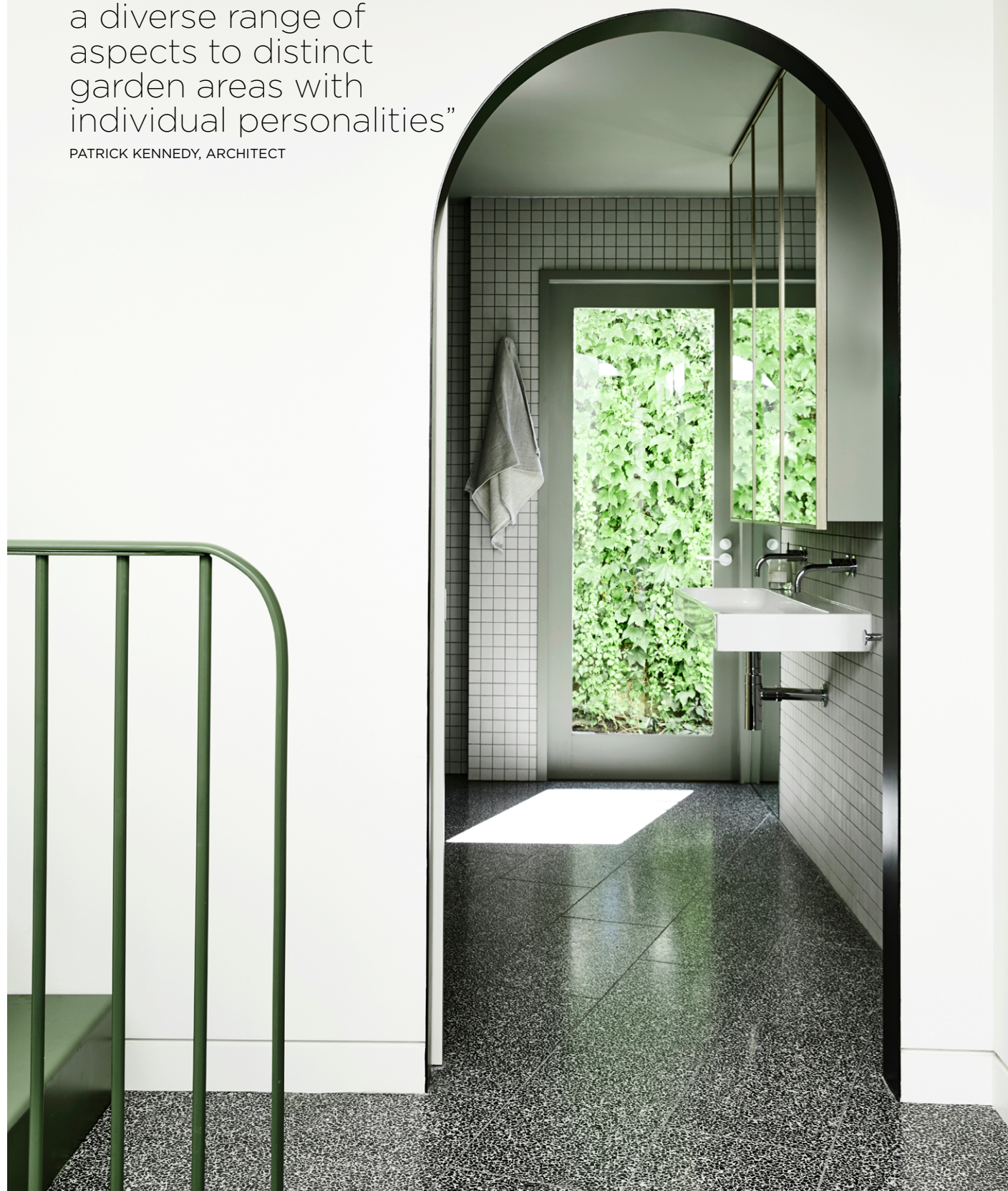
BATHROOM Light pours into the ground-floor powder room. Vola tapware and Studio Bagno basin from Mary Noall. The graphic interplay continues with gridded Sugie tiles from Artedomus and a black-edged archway that complement the extension's black steel windows and terrazzo flooring.