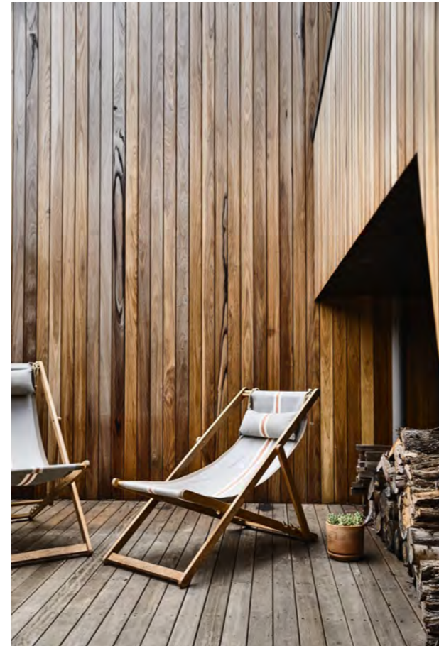
The interior and exterior have been designed to embed the home in its surroundings, from the timber cladding on the facade to the internal courtyards and the foliage-inspired colour palette